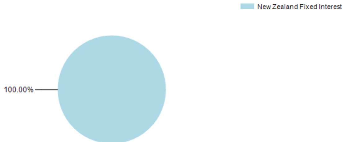
Target Investment Mix

'New Zealand fixed interest' may include international fixed interest.