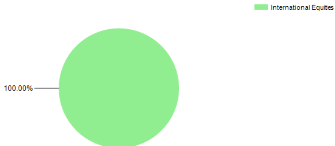
Target Investment Mix

Foreign currency was not hedged to New Zealand dollars as at 30 September 2025.