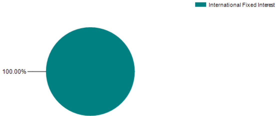
Target Investment Mix

Foreign currency exposure was 98.76% hedged to New Zealand dollars as at 31 March 2026