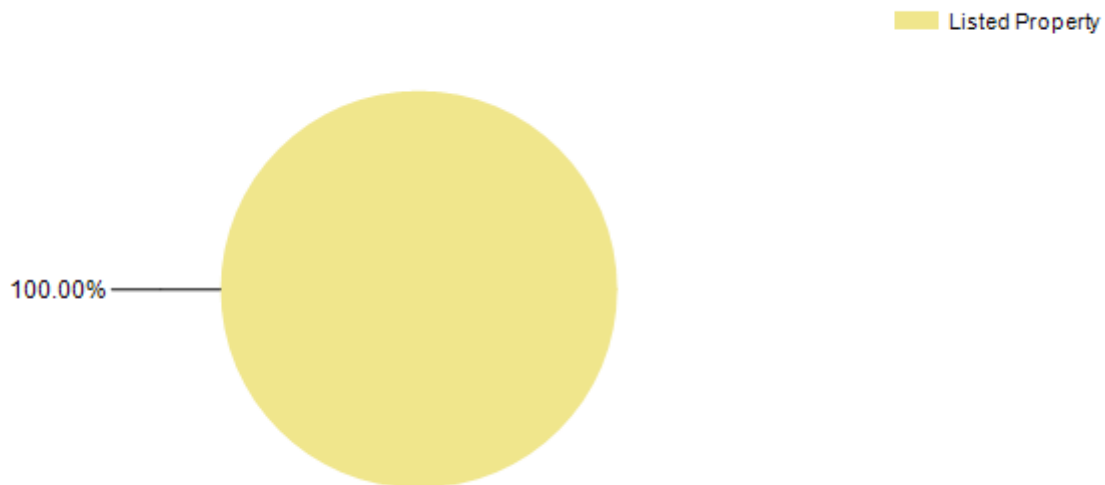
Target Investment Mix

The fund targets a position of being fully hedged back to the New Zealand dollar.